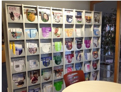
Library Common Area